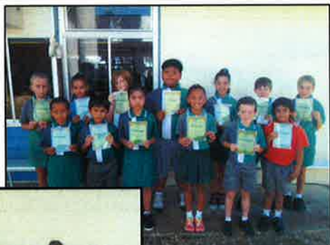
Gum Leaf recipients for weeks 7 and 8