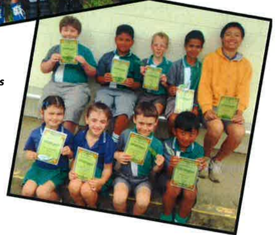
Week 7 Gum Leaf Award Winners