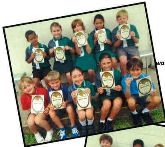
Week 7 Gum Nut award Winners